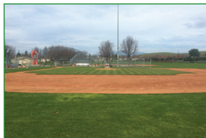
San Ramon Sports Park

throughout the City was also completed, and repairs included replacing base anchors, pitching rubbers, and home plates. The work was performed in December and January, and fields were opened by February 1, 2020.